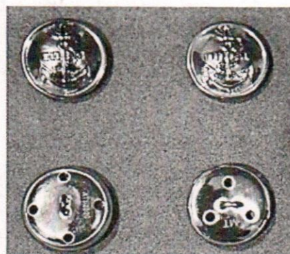
Size for Button 23 mm ( ^9/_{10} " ).