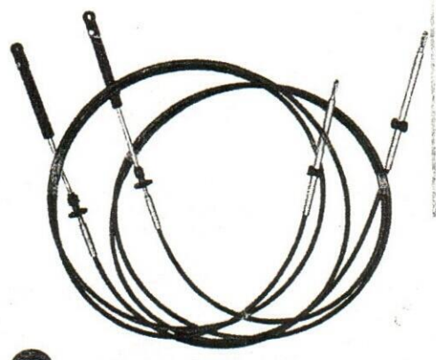
Fig: THROTTLE LINKAGE CONTROL CABLE