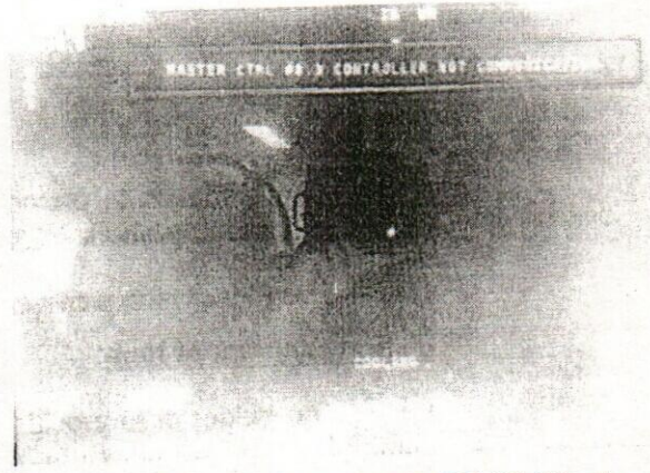
Pic 2: Error indication on EO/IR Display