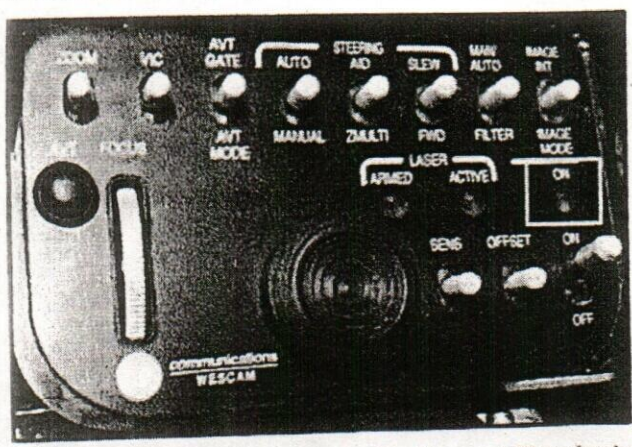
Pic 1: Hand Controller ON indication not illuminated

3. Description of Defect. When the Hand Controller is switched ON, the power Indication of the hand controller is not illuminated and the EO/IR system cannot be powered ON by the Hand Controller. "MASTER CTRL #8.3 CONTROLLER NOT COMMUNICATING" message is also displayed in the EO/ IR display when the Hand Controller is switch ON.