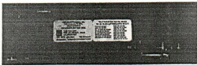
Figure: Battery Pack